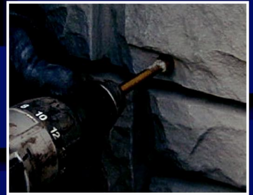
Photo showing a firstner type bit for countersinking anchor hole and one of many types of concrete anchors.

Roto-hammer the pilot hole before inserting or screwing concrete anchors.